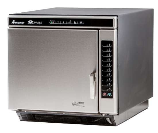
Model ACE19N shown