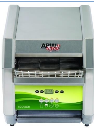
Model ECO 4000 350E