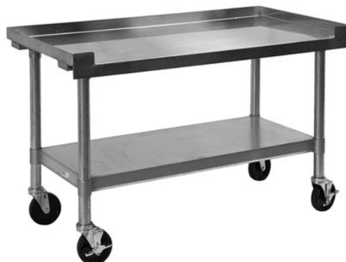
Medium Duty Cookline Stand