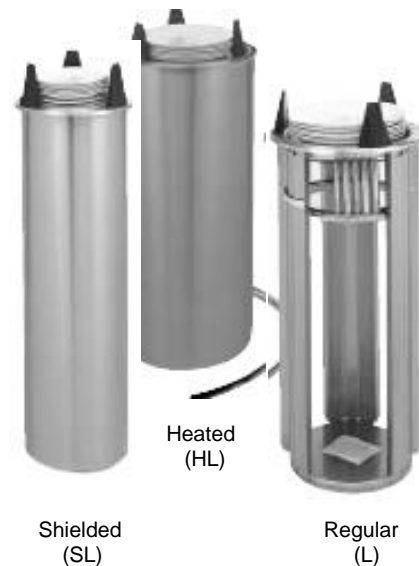
Model: Lowerator® Drop-In Dish Dispensers