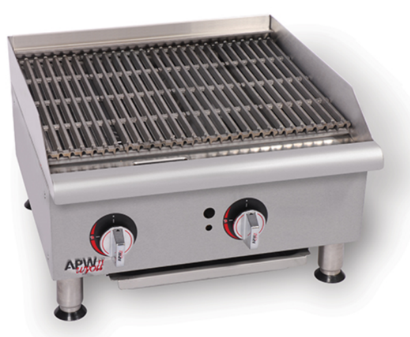
Model GCRB-24i Gas CharRock CharBroiler