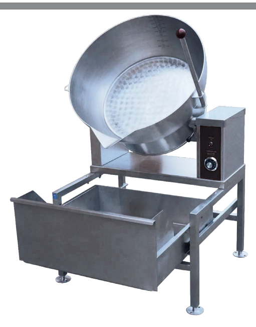
ACECTRS-16 Model Shown with stand