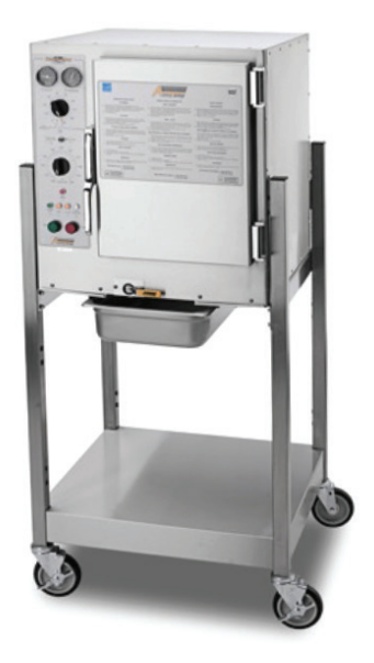
S6 Stand Mounted Steam'N'Hold™ Steam Cooker with optional 4" drain pan