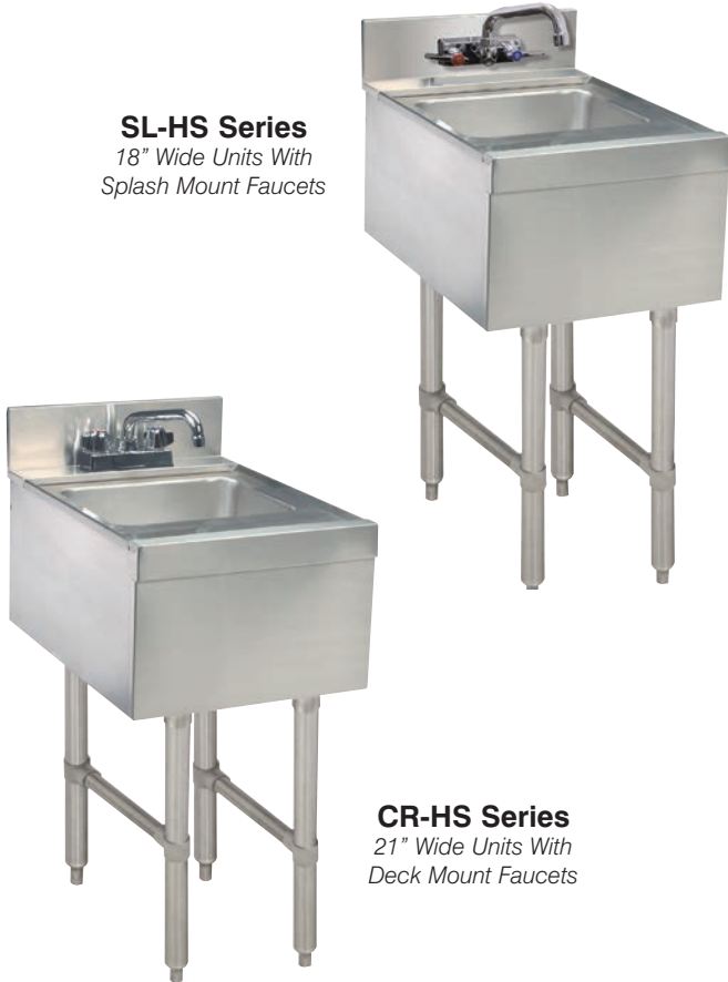
CR-HS Series 21" Wide Units With Deck Mount Faucets

Conforms To NSF 61/9 Lead Free Requirements