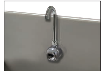
Hands-Free Electronic Faucet