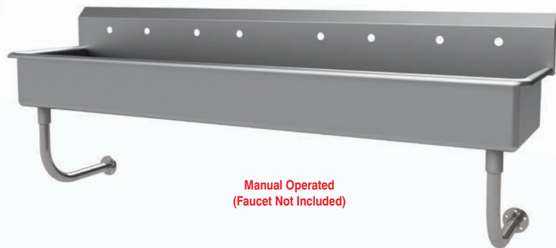
Manual Operated (Faucet Not Included)

Item #: _____ Qty #: _____ Model #: _____ Project #: _____