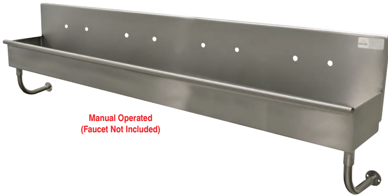
Manual Operated (Faucet Not Included)