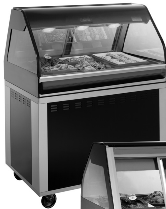
EU2SYS-48 FRONT VIEW SHOWN WITH OPTIONAL CASTERS