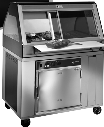
EU2SYS-48 Back view shown with 750-TH-II Cook & Hold oven and optional casters