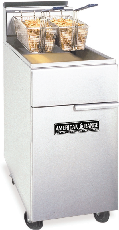
AF50-HE Shown with optional casters

You get a faster and better fryer from AMERICAN RANGE, with the latest technology incorporated into its design, and tons of features and benefits to suit the everyday demanding needs especially during extreme operating periods. Bringing added value and assured performance, by offering superior recovery. The ample cool zone prevents food particles from carbonization while extending oil life. Our unique vessel tank design features a deeper oil level, for larger food products, and a sloping vessel bottom for quick and complete draining of oil and debris.