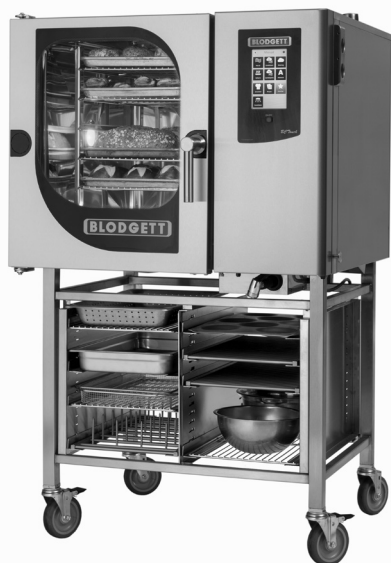
Shown on optional stand with casters

Boilerless Combination-Oven/Steamer with Touchscreen Control