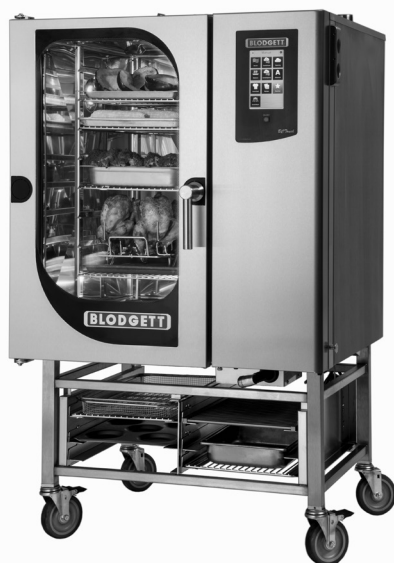
Shown on optional stand with casters