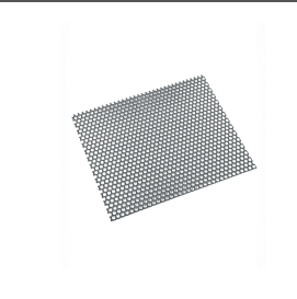
COVER, DRIP TRAY-PERFORATED