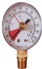
GAUGE, WATER FILTER EQHP