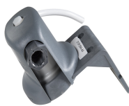
WATER FILTER HEAD, EQHP-VHD