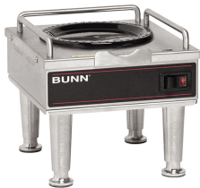
RWS1, 120V-SATIN NKL LEGS