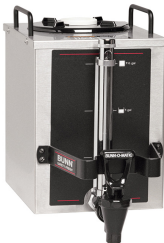
1.5GPR-FF, TOP HNDL