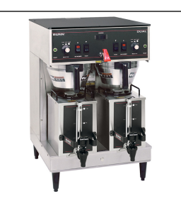
DUAL,120/240V 3S MECH SF