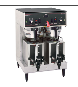
DUAL,120/208V 3S MECH