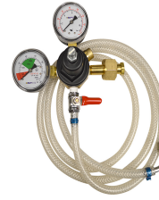
KIT, PRIMARY CO2 REGULATOR