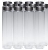
BOTTLES, GLASS WATER 12PK