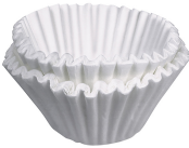
FILTERS TEA/SYS2 500PK/1 50/CL