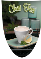
DISPLAY, GRAPHICS CHAI TEA