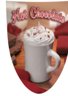
DISPLAY, GRAPHICS HOT CHOC