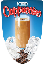
DISPLAY, GRAPHICS ICED CAP