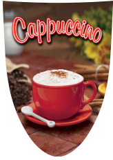
DISPLAY GRAPHICS IMIX-3