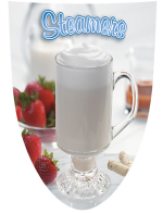
DISPLAY, GRAPHICS STEAMERS