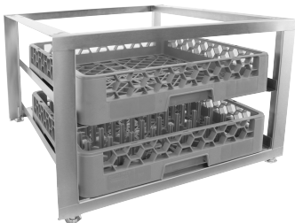
Universal Pedestal (24"W X 25-3/8"D X 15-1/4"H)