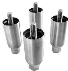
6" and 4" Stainless Steel Legs