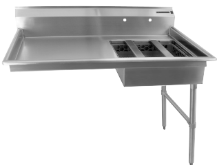
48" Undercounter Dishtable