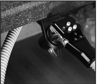
Premium quality 5-button, post-mix soda gun by Wunder-Bar with fast, low foaming delivery.