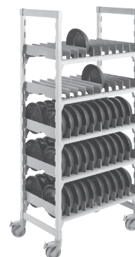
Dome Drying and Storage Rack