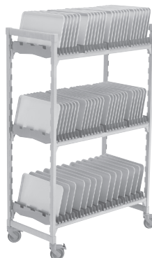
Vertical Drying and Storage Rack