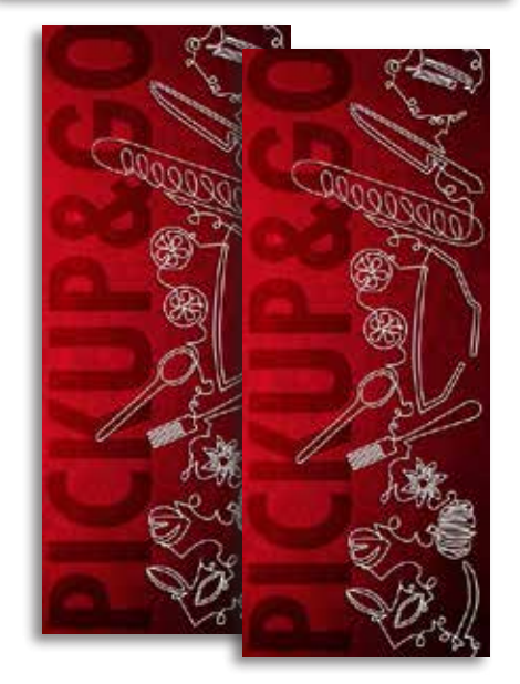
CSFLEXMERCH2 — Pickup & Go