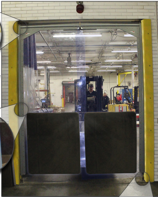
RUGGED, ROBUST FRAME