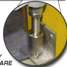
STANDARD, HEAVY-DUTY GALVANIZED STEEL HARDWARE