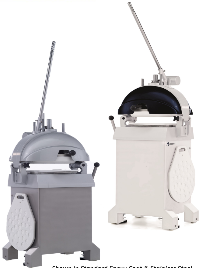
Shown in Standard Epoxy Coat & Stainless Steel