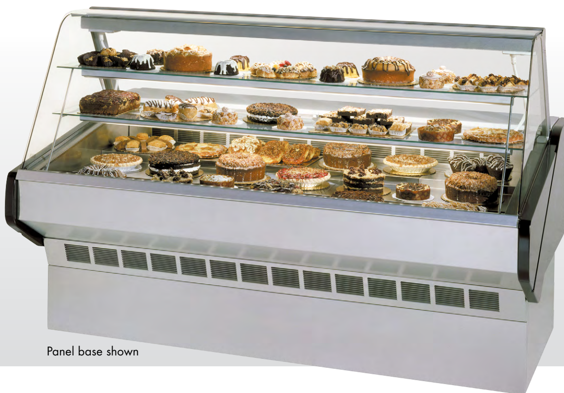
Panel base shown

Market Bakery. The low profile merchandiser that provides solutions to your merchandising needs. Cases are available in lengths of 3', 4', 5', 6', and 8'. Designed for continuous case line-ups without middle end glass.