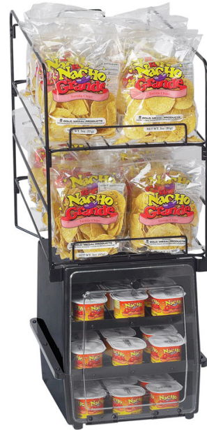
Unit shown with 2 Tier Shelf Rack (Model 5339) for image reference only (rack sold separately).