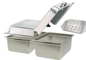
Item No. 8080-03