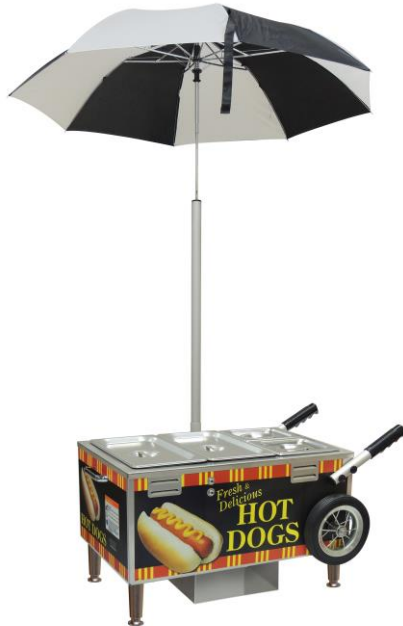
Model 8080S Sterno Hot Dog Cart