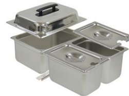
Item No. 8080-01