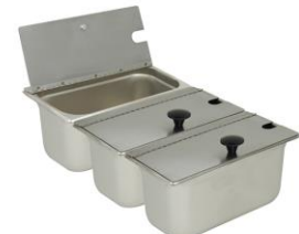
Item No. 8080-04