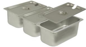
Item No. 8080-02