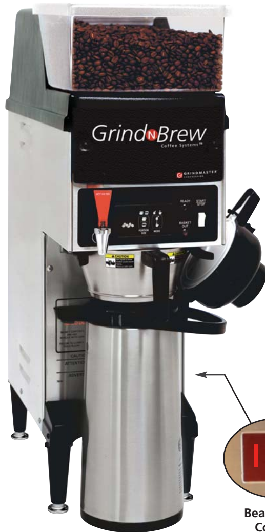
Model 10H (Airpot sold separately)