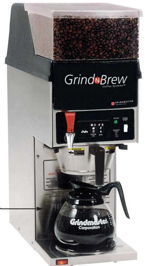
Model 11H (Decanter sold separately)

Digitally controlled Single Bean Grind'n Brew™ Brewer System. Brewer will maintain brew temperature to \pm 1^\circ\text{F} throughout brew cycle. Brew temperature, brew volume (full and half batch), grind portions (full and half batch), operator defined pre-infusion/pulse brewing, energy savings and Low Temp/No Brew are programmable from the front display.