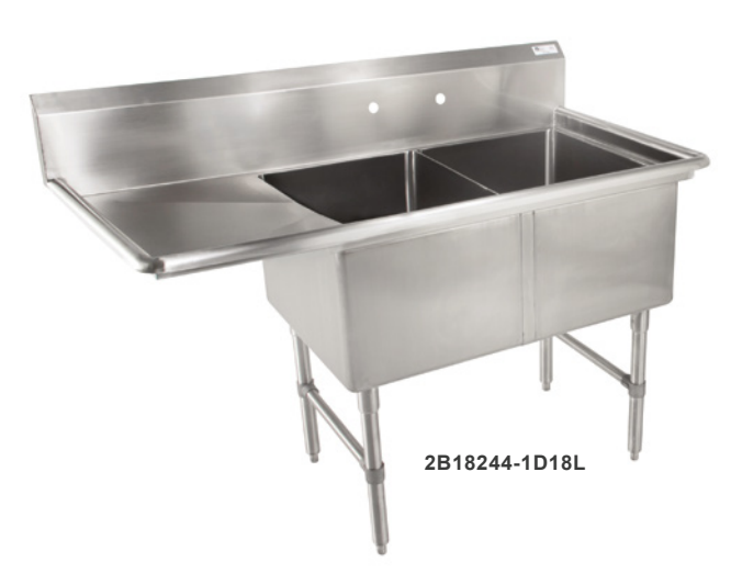
SPECIFY LEFT SIDE OR RIGHT SIDE DRAIN BOARD