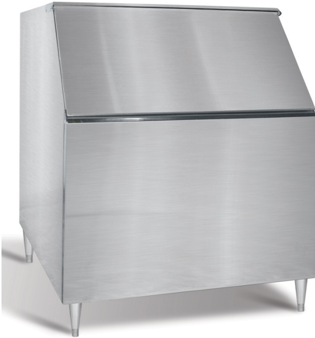
Maxx Ice Machine Shown on Bin