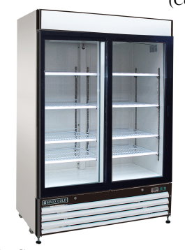
MXM2-48RS (Door: Sliding) IMAGE SHOWN MXM2-48RSB (Color: Black Door: Sliding)

Glass Door merchandisers are designed for durability and visual appeal in promoting your product. Glass door merchandisers are energy efficient and effective at keeping product at exactly the right temperature. This keeps food fresher for longer. The simple-to-use but precise digital controls allows for accuracy in temperature and flexible use of the unit.