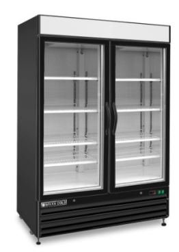
MXM2-48RB (Color: Black)