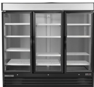
MXM3-72RB (Color: Black)