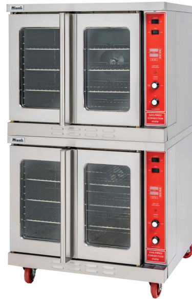
(2) C-CO1-NG/LP Stacked