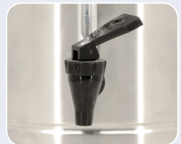
Non-Drip Water Faucet