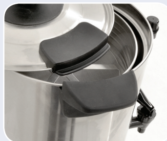
Locking Lid and Handles