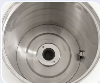
Stainless Steel Interior