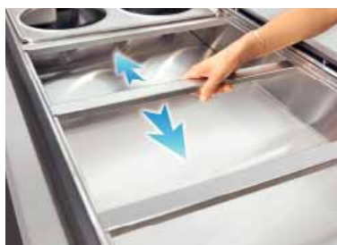
Adjustable adapter bars can be custom configured for many pan sizes and salad bar layout

The innovative "Cool Breeze" technology allows you to maintain product at 41 degrees Fahrenheit or less yet requires no ice. This Dropin unit cascades a "Cool Breeze" of air over the product without drying it out or causing freezer burn.