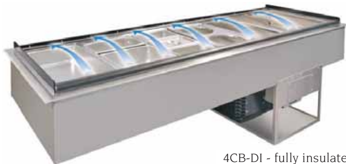
4CB-DI - fully insulated Cool Breeze Drop-in