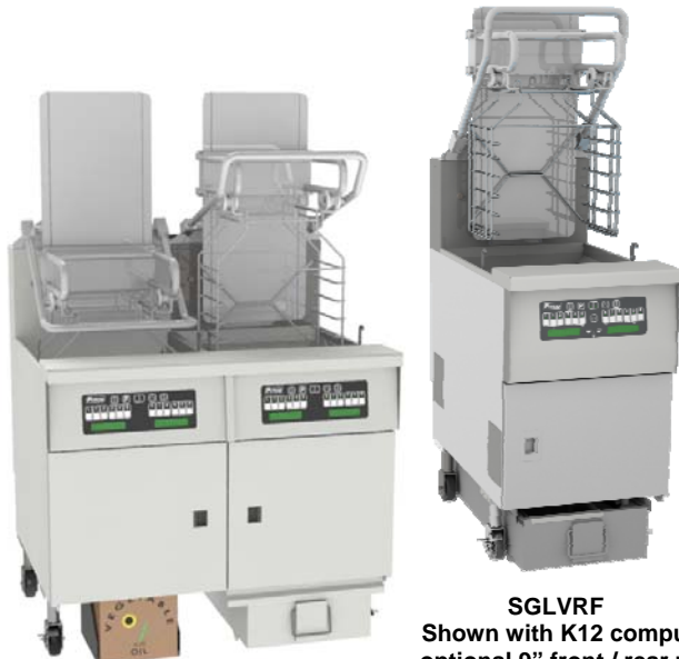
SGLVRF DUAL Shown with K12 computer, optional 9" front / rear rigid casters

SGLVRF SOLSTICE GAS REDUCED OIL VOLUME RACK FRYER