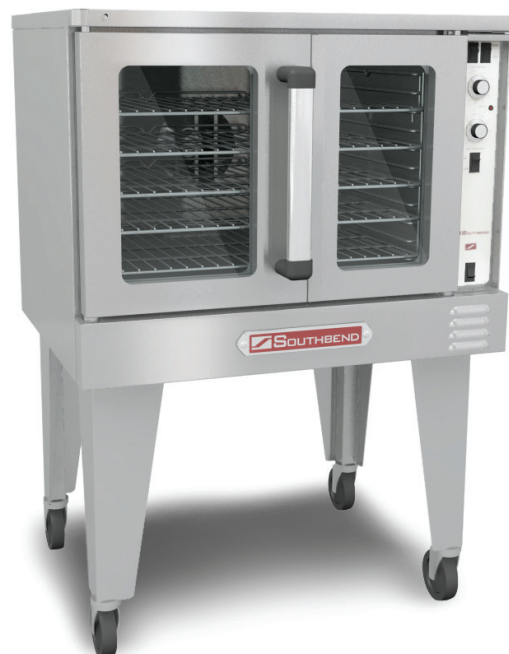
(ES/10SC shown with optional casters)