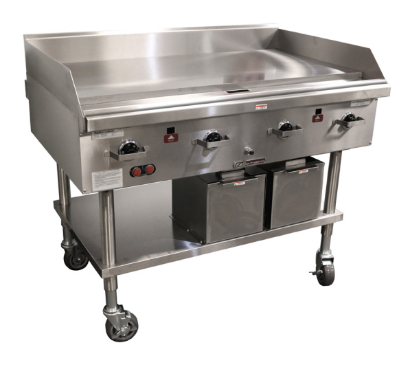
Model shown HDG-48V