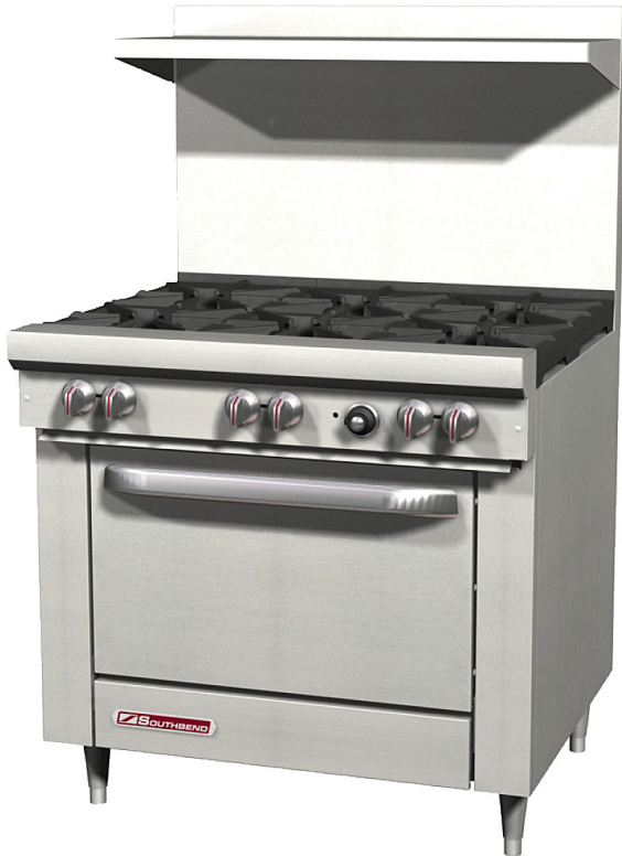
S36D (shown with optional casters)