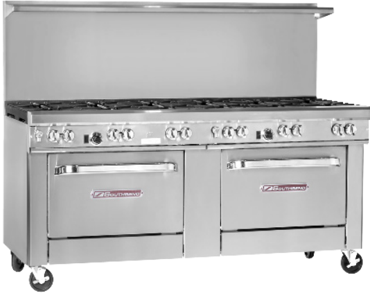
4721DD (shown with optional casters)