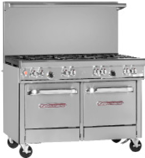
4481EE (shown with optional casters)