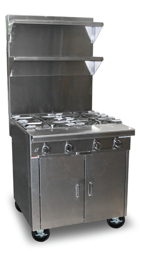
Model P32A-XX with optional 36" flue riser, optional removable cast iron grate tops and optional casters