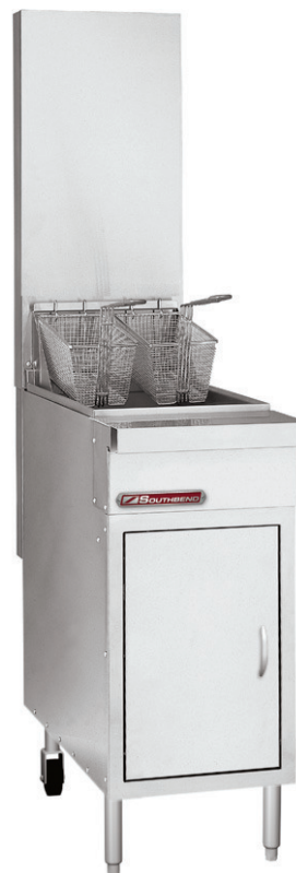
(shown with 36" high flue riser)