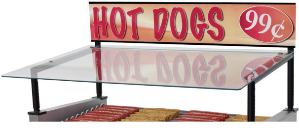
50SG-G with optional sign holder