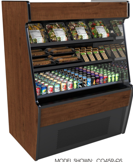
MODEL SHOWN: CO45R-QS