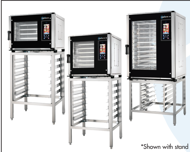
*Shown with stand